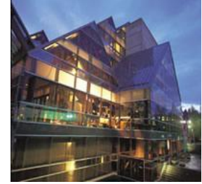
The Hult Center for the Performing Arts

Eugene enjoys a national reputation as one of the most livable cities in the country. It is that rare kind of place where small town charm and big city sparkle mesh perfectly to form a real community. Eugene offers opportunities for a wide variety of activities for all interests, including skiing, rafting, biking, running, and a number of cultural opportunities. For the sports fan, Eugene is home to the Oregon Ducks and is considered the Track Capital of the USA. The four seasons here provide an opportunity to have different experiences year round. This family friendly community offers a choice of high quality public and private schools with many youth activities. The Eugene area offers many choices for affordable housing for renters and home owners alike. A variety of churches and community groups abound.