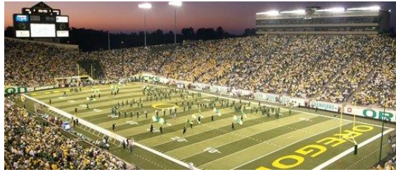
Fans at a Ducks Football game